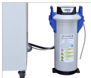
BINDER PURE AQUA Service