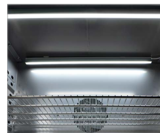
LED strip light accessories