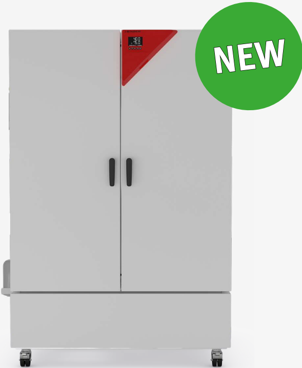
Model KBF-S ECO 720 Sizes 247 L, 720 L, 1020 L